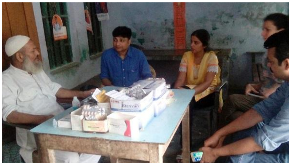
Figure 1: Senior representatives from CHAI and PDS during a productive field visit in Gonda district

Apart from the regular working activities which include daily doctor visits, interpersonal calls to HCPs, joint working with DCs, PC, PD and senior members from CHAI few other engaging activities too were done during this quarter which directly/indirectly contributed to better productivity of this programme. These activities included CME with local providers and RMPs along with field visits of external visitors in respective villages/tehsils covered under the same. The copy of a CME report of Sant Kabir Nagar dated 22 nd May has been attached with this report which features the combined meet with RMPs and pharma providers of the district.